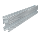
T-slot Rail H45