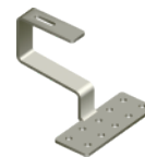
Tile Hook H132