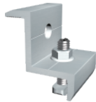
End Clamp Kit