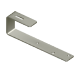
Asphalt Shingle Hook H75