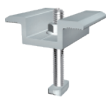
Inter Clamp Kit