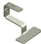
Tile Hook H120