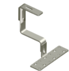
Adjustable Tile Hook 1