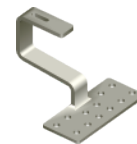
Tile Hook H145